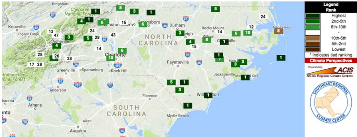
Precipitation rankings for the period July 1, 2015 - June 30, 2016.

The period from July 1, 2015 to June 30, 2016 saw above normal precipitation and temperatures across the state, with many stations experiencing one of their top 5 wettest and warmest years for the period, as seen in the figure below of precipitation rankings. Most of the above-normal precipitation occurred during the fall and winter, while summer 2015 and spring 2016 both experienced below-normal precipitation in the western part of the state with a mix of above-below- and normal precipitation throughout the rest of the state.